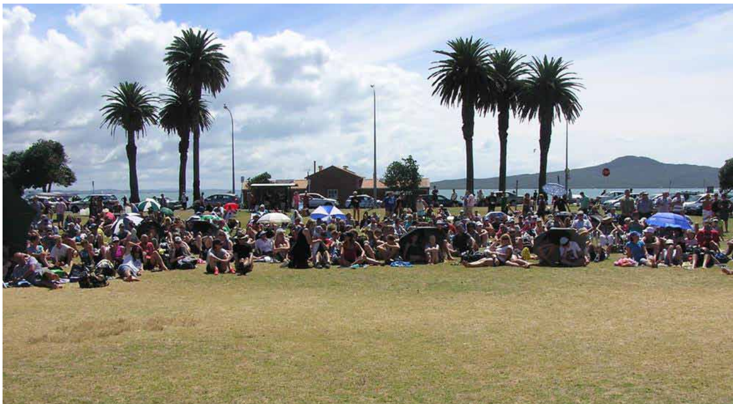
514 swimmers completed the event. It's hard to believe a short while before they were struggling through a rainstorm, no visibility and very choppy seas.