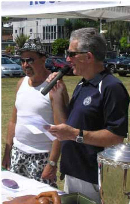
Time to give out the medals