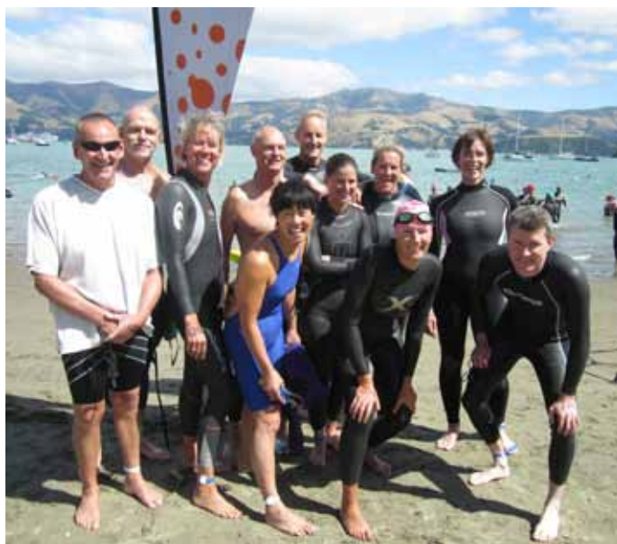
Jasi Club team.