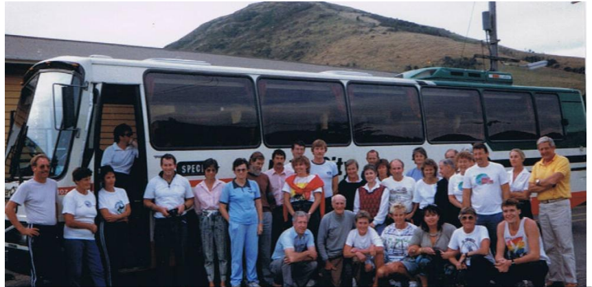
Ed: Remember when... found this old photo recently and have great memories of events in Christchurch thank you all – that bus trip out to Akaroa in 1987 was a real hoot and some of us are still competing today...recognise anyone?

Once swimming got underway the events were back to back for those competing in 4-5 events. It always amazes me how good a Swim Meet can be held with a small number of swimmers. At Meet end, the pool management opened the hydro slides so us big kids could have a go. Great rides were had by all. Drinks, dinner and prize giving followed. Everyone enjoyed a great meal and catching up with others. Thanks Greymouth Masters for a great Meet