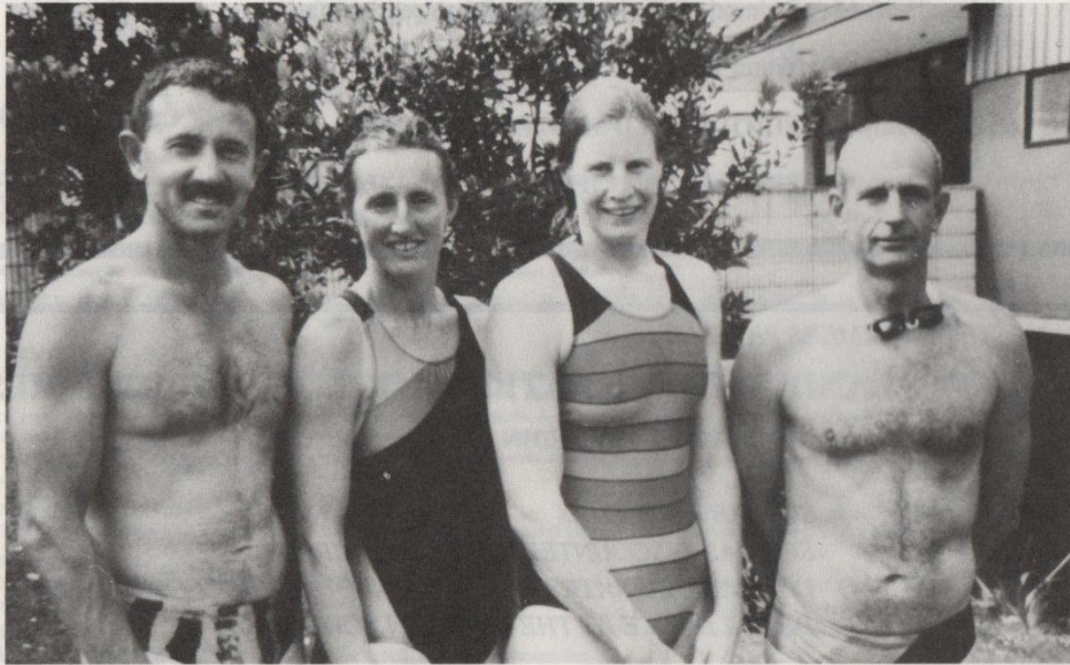
World Record breakers at the North Island Short Course Championships.