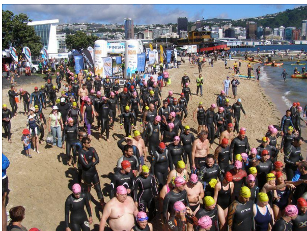
Swimmers heading for the start line at Oriental Bay.

Go to www.oceanswim.co.nz for more info and