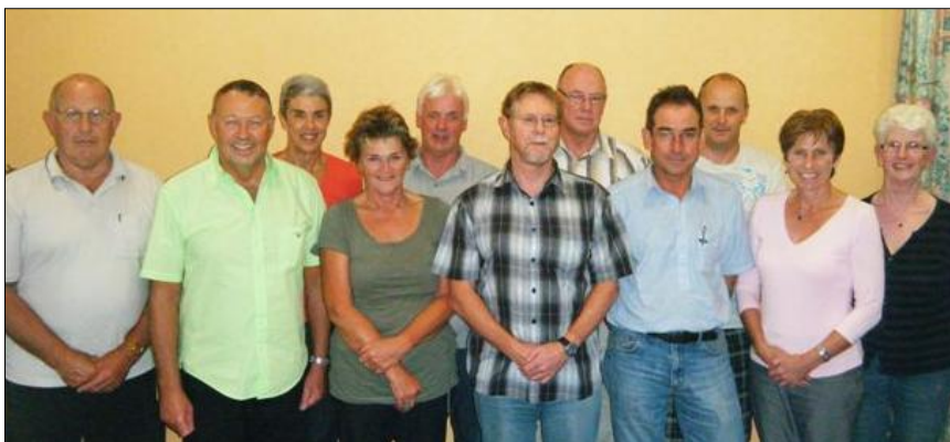
NZMS Delegates and newly elected Executive at the 2011 AGM

Overseas Swim Competitions: There are no restrictions on New Zealand Masters members competing in sanctioned Masters events overseas. A copy of their membership card may need to be included with the entry form. These cards may be obtained from the National Secretary (as you will be aware, since 2009 memberships cards have not been sent out routinely to financial Masters swimmers). NZMS is not responsible for organizing entry forms, travel and accommodation for Masters Swimmers competing overseas. Swimmers compete as members of their own Masters club and not NZMS. Nor does NZMS endorse any one travel agency for such events but any travel agency can advertise for business on the NZMS website providing an advertising fee is paid to NZMS