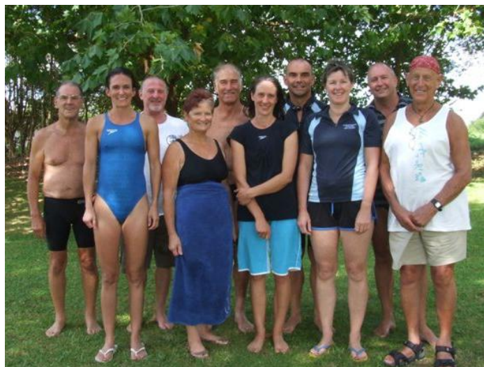
Katikati Masters enjoying the sunshine in Cambridge